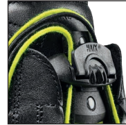
HAIX® Fast Lacing Fit System