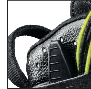
HAIX® Climate System