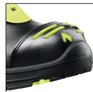
HAIX® High Durability Cap System