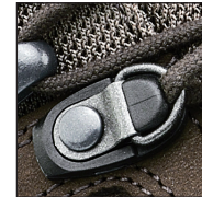
HAIX® 2-Zone Lacing