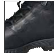
The inside of the shoes is made from very abrasion-resistant leather – no seams in the lacing area; ideally suited for “fast roping”