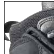
HAIX® Climate System