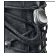
HAIX® Smart Lacing