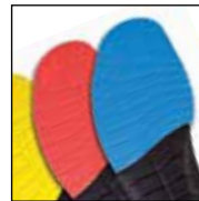
Vario Wide Fit System